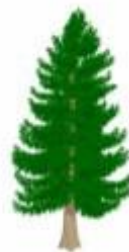
An Evergreen Tree