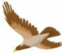
A Bird Flying