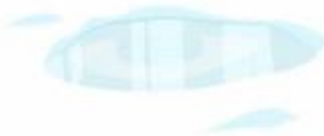
A Frozen Puddle