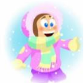
Snowflakes On Your Face