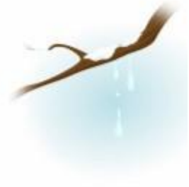
Water Dripping From A Branch