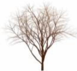
A Tree That Has Lost Its Leaves