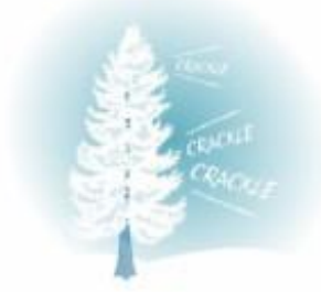
A Frozen Tree Crackling