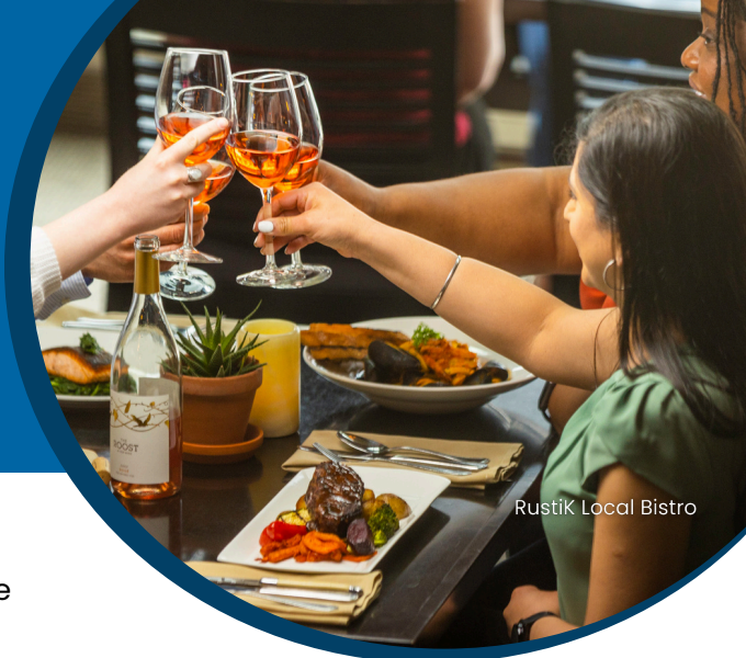
Rustik Local Bistro

Guided by the Tourism Strategy and Action Plan, support for Orangeville's tourism sector included the development of content, experiences, and tools that leveraged the growing awareness of the Love, Orangeville brand. Collaboration with local partners, organizations, and businesses led to stronger relationships and new opportunities to foster tourism and culture, in and around Orangeville.