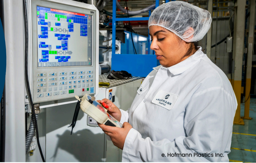
e. Hofmann Plastics Inc.