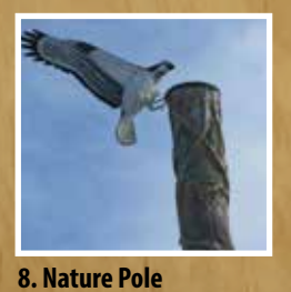
Dragonfly Park Artist: Headwaters Carving Background: This piece depicts the flora, fauna & wildlife of the area & was carved several years prior to the initiation of Orangeville's