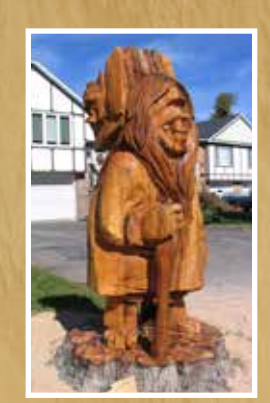
19. The Troll 72 Town Line Artist: Walter van der Windt