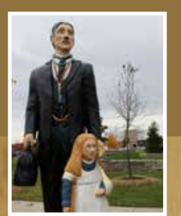
1. Physician & Patient 100 Rolling Hills Drive Artist: Jim Menken